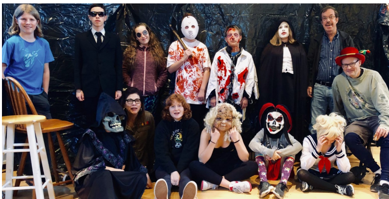
Haunted House pictures